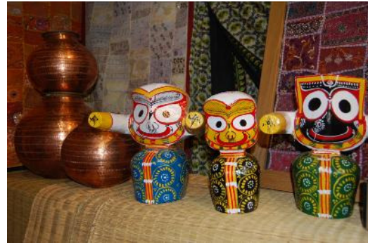
How bizarre ... there are many interesting and beautiful things at the Bazaar